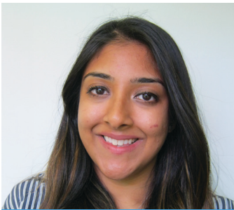
MRS PATEL Y3/4/5 TEAM LEADER/ DEPUTY DSL